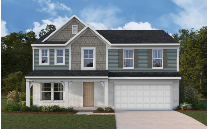
WESTERN CRAFTSMAN (WITH OPTIONAL BRICK)