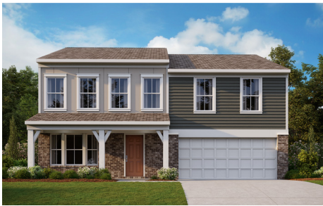
AMERICAN CLASSIC (WITH OPTIONAL BRICK & PORCH)