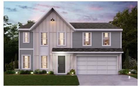
MODERN FARMHOUSE (WITH OPTIONAL BRICK)