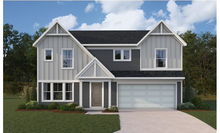
MODERN RETREAT (WITH OPTIONAL BRICK)