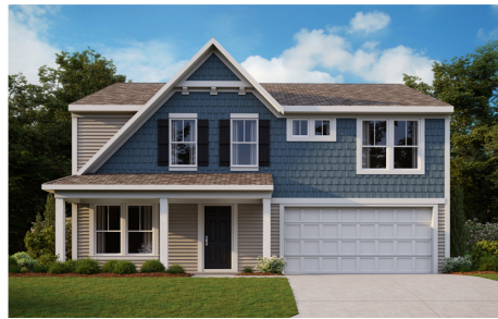
COASTAL CLASSIC (WITH OPTIONAL BRICK)