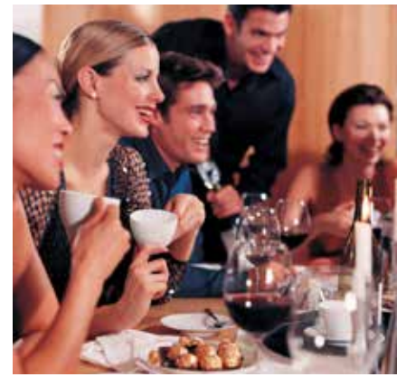
MORE DINNERS OUT W/ FRIENDS