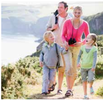
A DREAM VACATION EVERY YEAR