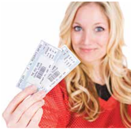
GET SEASON TICKETS